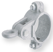
REGULAR BEARING HANGER